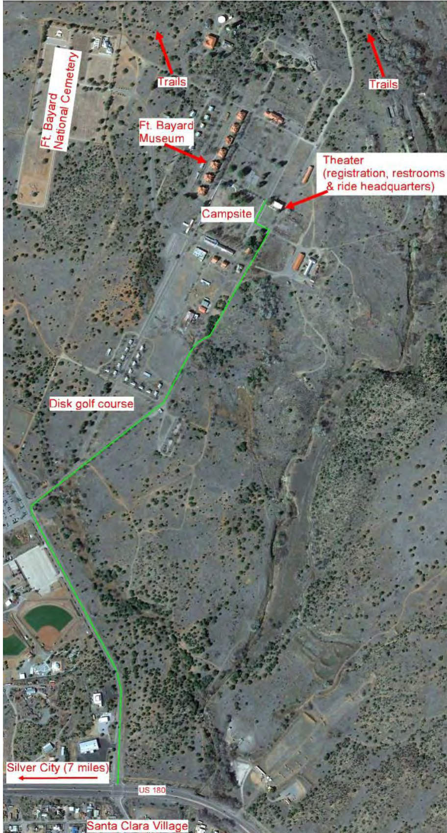
Map of Ft. Bayard